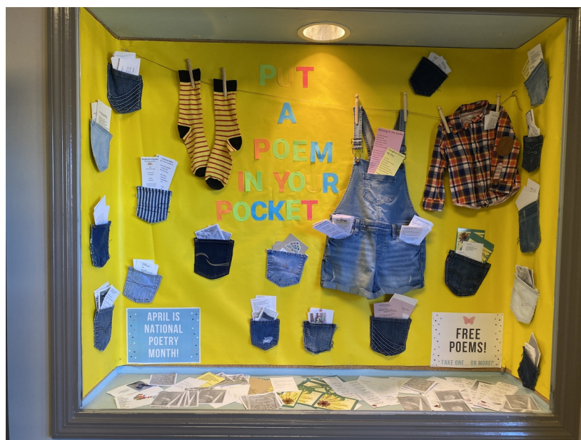
Community Poetry at Oneonta Public Library

To Live Your Poem is to do the things that bring you joy; to do the things that make you feel connected; to take time and give time; to love the world, to let go...let go... let go.