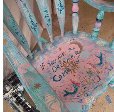
"if you are dreamer come in..."